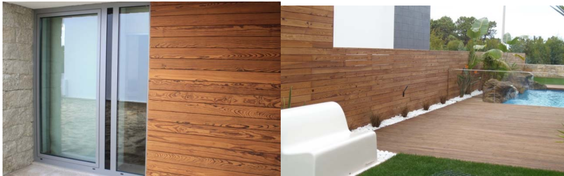
Figure 2: Example of Cladding and Decking applications from Santos & Santos.

The wood species commercialised with Thermowood® treatment imported from Finland are mostly Nordic pine, fir and birch. Santos & Santos is treating mainly maritime pine; the most common species in Portugal, and also some ash but tests are being made to allow the treatment of blue gum wood which is considerably cheaper. Wood species commercialised with Kebony® are Nordic pine, Acer , birch and SYP (southern yellow pine).