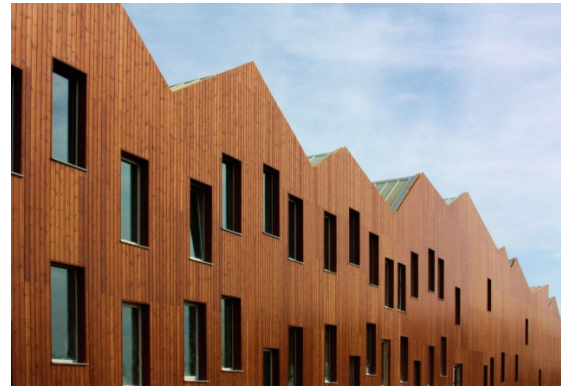
Figure 7: School Centre facade in Mouriz

Jular has also been working with Thermowood® for several years and developed module wooden houses called Treehouse® that can be made with Thermowood® (Figures 9 and 10). The biggest project developed by Jular was an Ecocamp Resort in Zambujeira do Mar (Alentejo) called Zmar (Figures 10 and 11) but this company has made several other relevant projects like the Hotel-Bar Convento do Espinheiro (Figure 8).