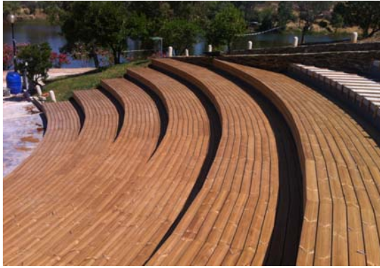
Figure 6: Amphitheatre in Mértola