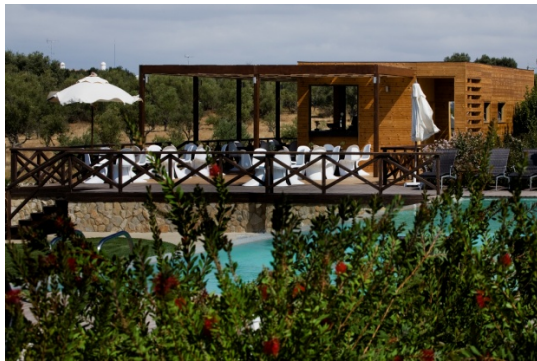
Figure 8: Hotel-Bar Convento do Espinheiro

Jular has also been working with Thermowood® for several years and developed module wooden houses called Treehouse® that can be made with Thermowood® (Figures 9 and 10). The biggest project developed by Jular was an Ecocamp Resort in Zambujeira do Mar (Alentejo) called Zmar (Figures 10 and 11) but this company has made several other relevant projects like the Hotel-Bar Convento do Espinheiro (Figure 8).