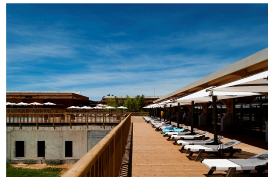
Figure 11: Zmar in Alentejo

Though involving less amounts of wood other projects done with heat treated wood from Plato® were developed by Carmo Industries like the deck pictured in figure 12.