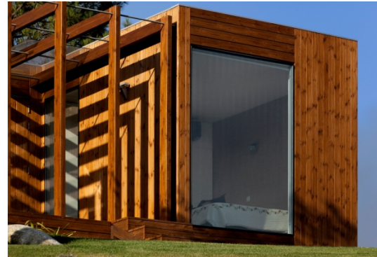
Figure 9: Treehouse@in Douro region