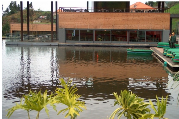
Figure 5: Thematic Park in Madeira Island

In Mértola, in the South of Portugal, the renovation of an Amphitheatre was also made with a Thermowood® deck (Figure 6). On the other hand, one of the projects that involved higher quantities of Thermowood® was done in the Northern part of the country, the school centre of Mouriz, where the entire facade was made with modified wood (Figure 7).