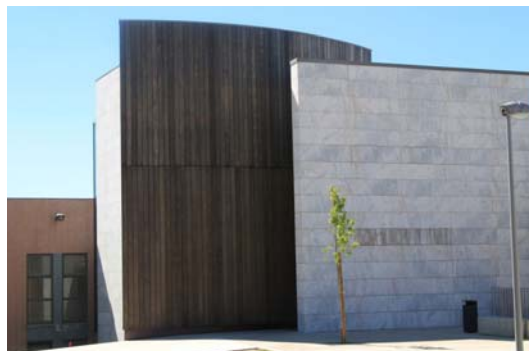
Figure 13. Swimming pools in Penafiel (Kebony®)

Projects using Kebony® have been so far less and usually smaller. Nevertheless, one of the biggest projects made with Kebony® wood by Banema was the renovation of the Penafiel Municipality swimming pools (Figure 13).