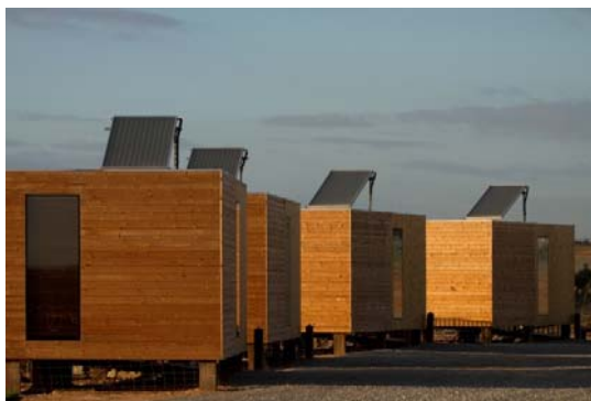
Figure 10: Treehouses@ in Zmar