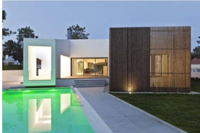
Figure 4: House in Vale Bem made with Thermowood®

The most emblematic projects with Thermowood® made by Banema were a house in Vale Bem (Figure 4) awarded with the The Best Architecture (Single Unit) Portugal 2010 and the Best Architecture (Single Unit) Europe 2010 in the European Residential Property Awards or a thematic Park in Madeira Island (Figure 5).