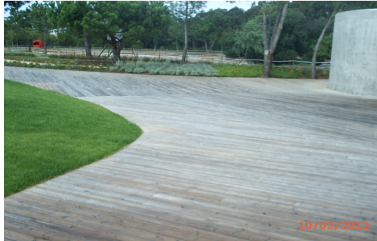
Figure12. Deck Buçaquinho (Plato®)

Projects using Kebony® have been so far less and usually smaller. Nevertheless, one of the biggest projects made with Kebony® wood by Banema was the renovation of the Penafiel Municipality swimming pools (Figure 13).